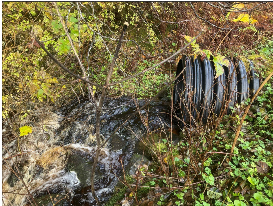
Figure 1.—Outlet of poorly-aligned culvert at waypoint 1018.