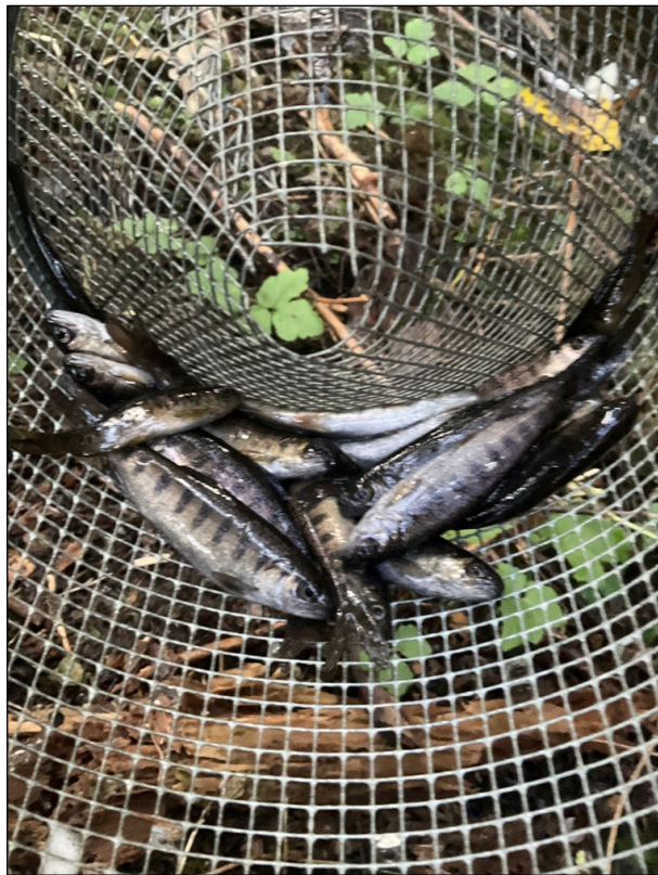
Figure 2.—Juvenile coho salmon captured at waypoint 1019.