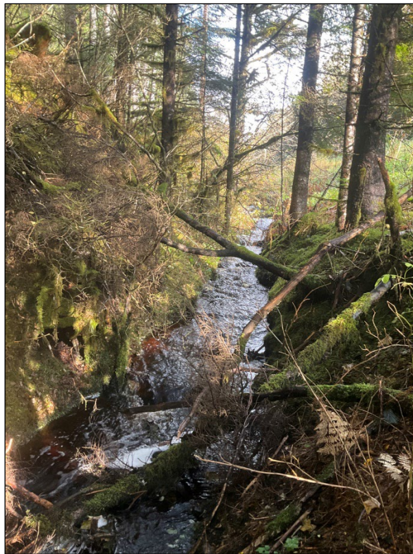
Figure 3.—Upstream view of Stream No. 111-50-10690-2000 at waypoint 1019.